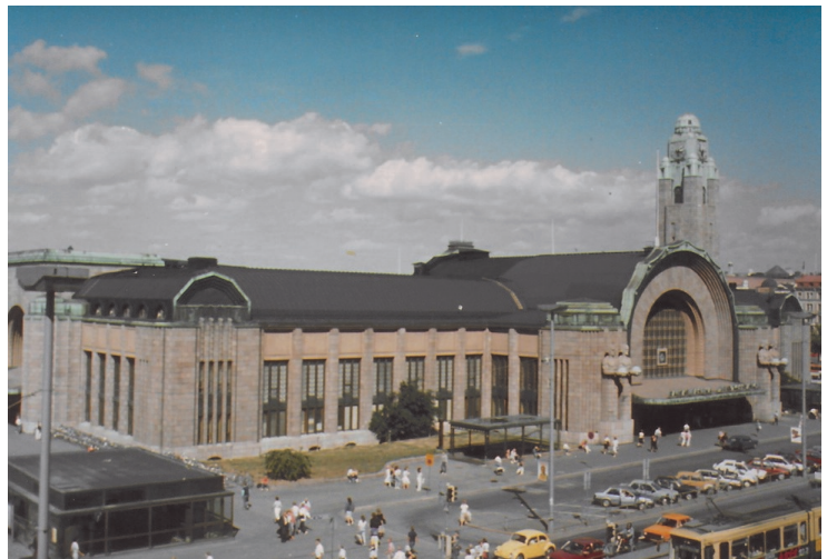
Helsinki Railway Station