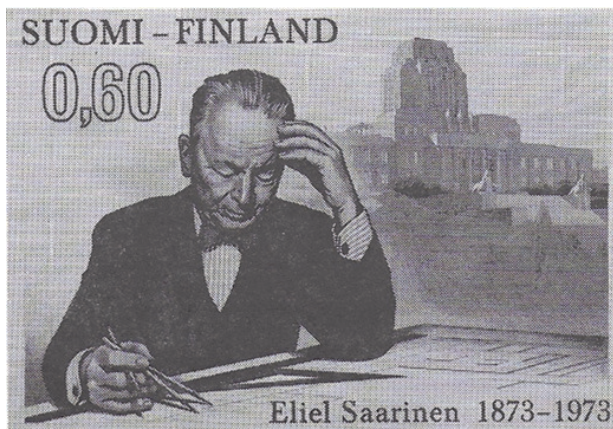
A postage stamp honors Saarinen